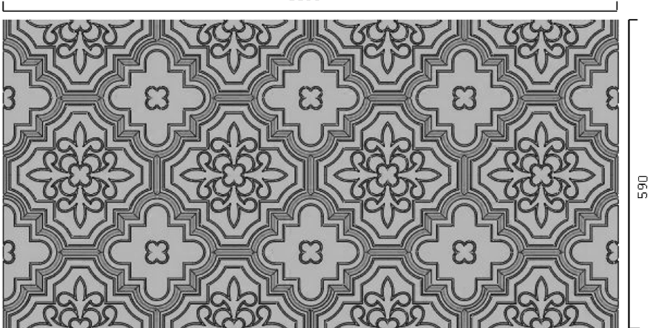
Installation using half pieces, with zero joint.